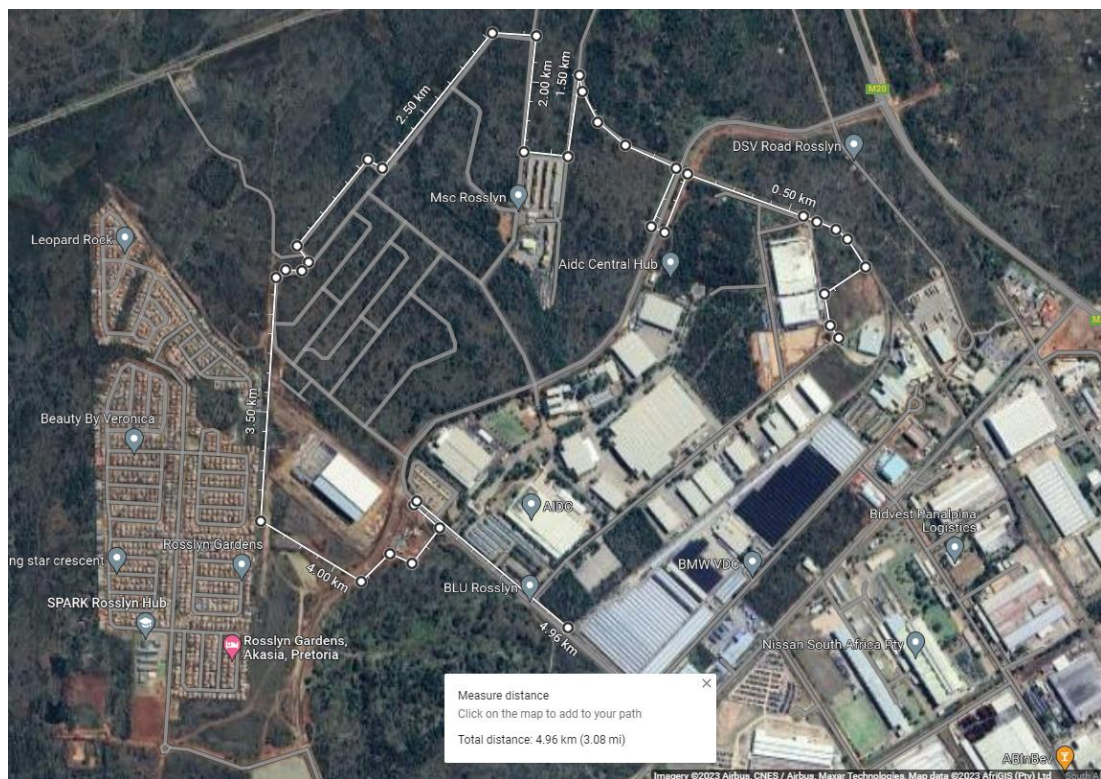
Figure 1 – Site Location (Google Satellite Image)

A satellite image of the site location is shown in Figure 1 below.